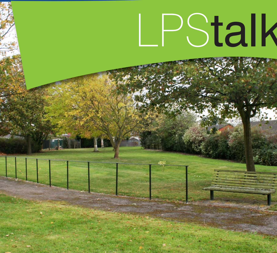
Handrail and re-landscaping of communal garden at Copthorne Lodge