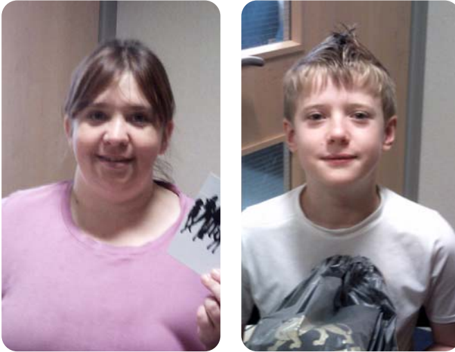
Pictured are some of the young prize winners from the Little Park Street Housing Office

After the success of the Kits for Kids initiative last year we decided that we wanted to do it again this year to try to help more people. We also wanted to make it easier and more flexible for people to enter.